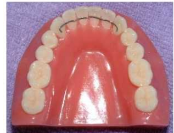
Lower Fixed Retainer