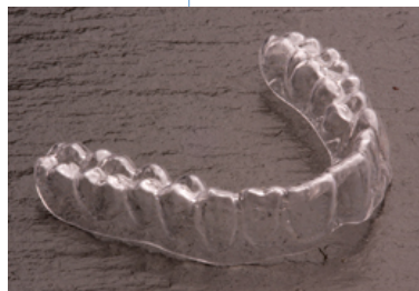
Essix Removable Retainer